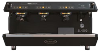
BL-500-DE 3 Gr Tall Cup