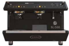
BL-500-DE 2 Gr Tall Cup