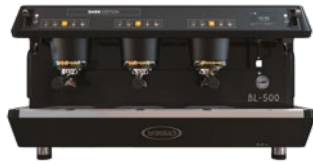
BL-500-DE 3 Gr