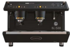
BL-500-DE 2 Gr